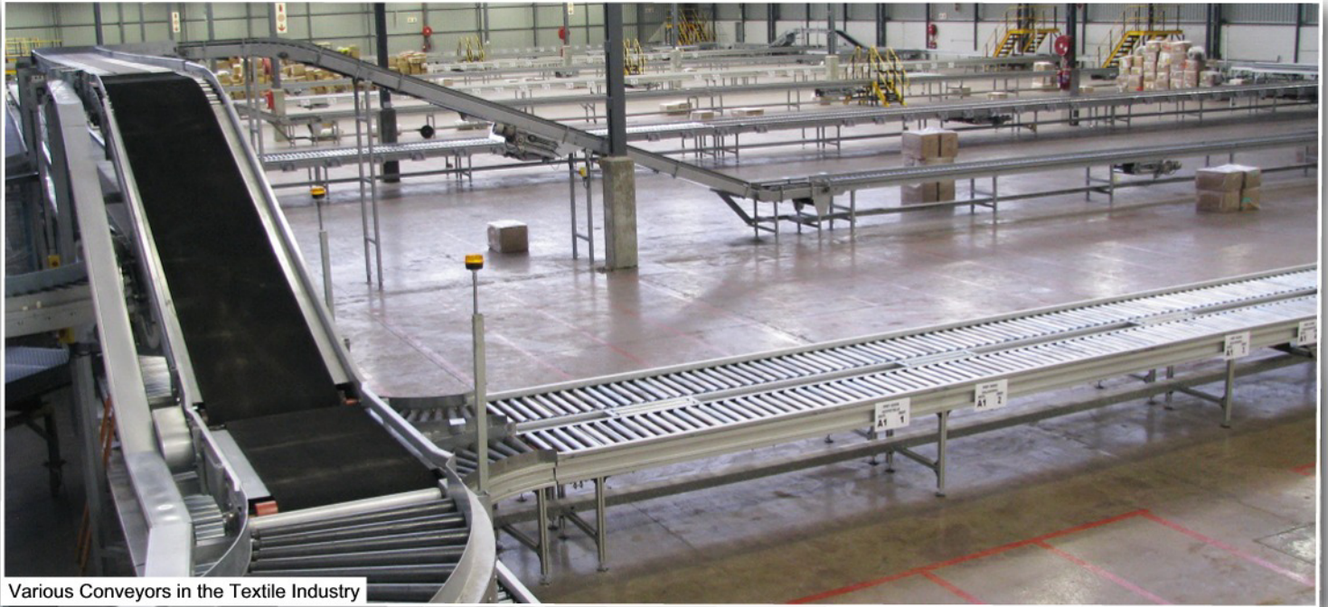
Various Conveyors in the Textile Industry

Conveyco has over the years evolved into a leader in the material handling industry with a product range offered by few. The introduction of our new aluminium conveyors to the industry, has catapulted Conveyco into world-class status.