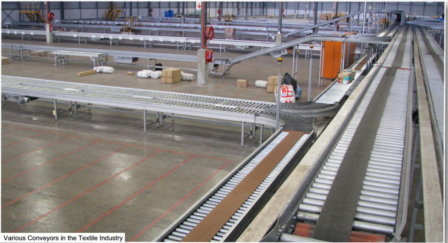
Various Conveyors in the Textile Industry