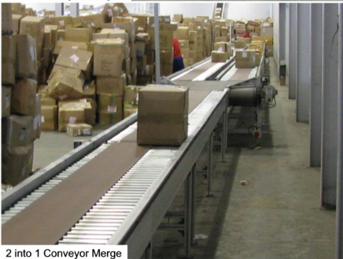
2 into 1 Conveyor Merge