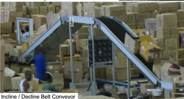
Incline / Decline Belt Conveyor