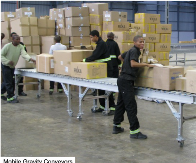
Mobile Gravity Conveyors