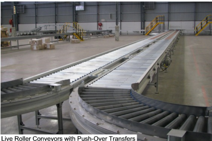
Live Roller Conveyors with Push-Over Transfers

Conveyco has over the years evolved into a leader in the material handling industry with a product range offered by few. The introduction of our new aluminium conveyors to the industry, has catapulted Conveyco into world-class status.