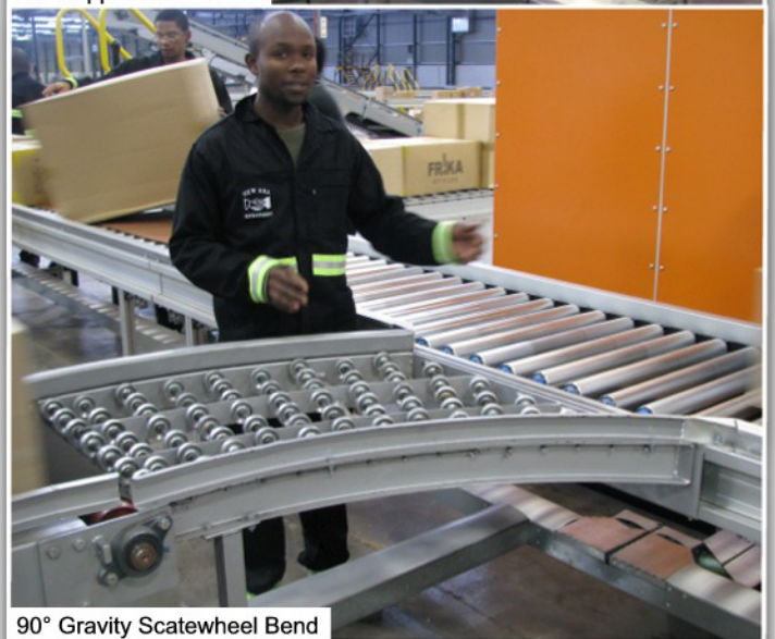
90° Gravity Scatewheel Bend