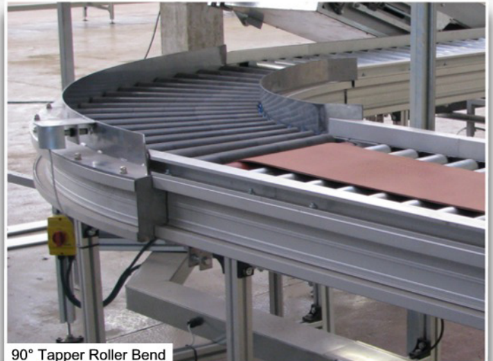
90° Tapper Roller Bend